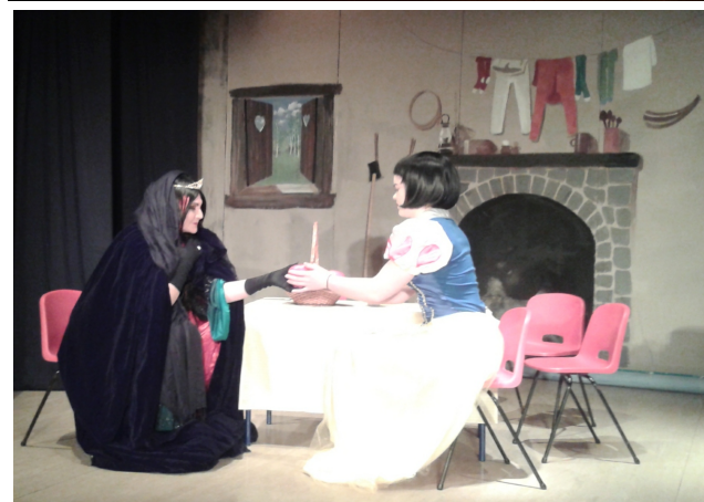
Scenes from this year's pantomime, Snow White