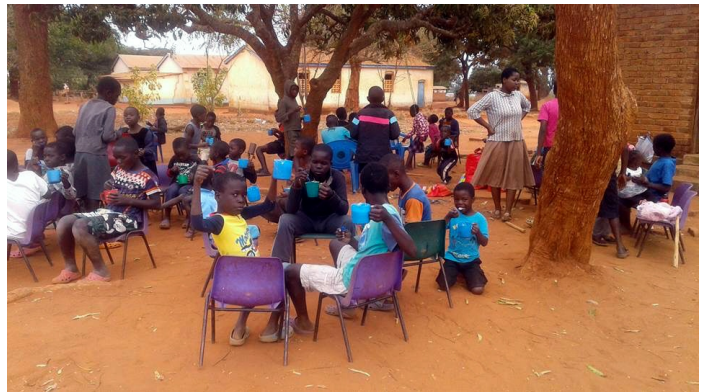
Porridge for needy children