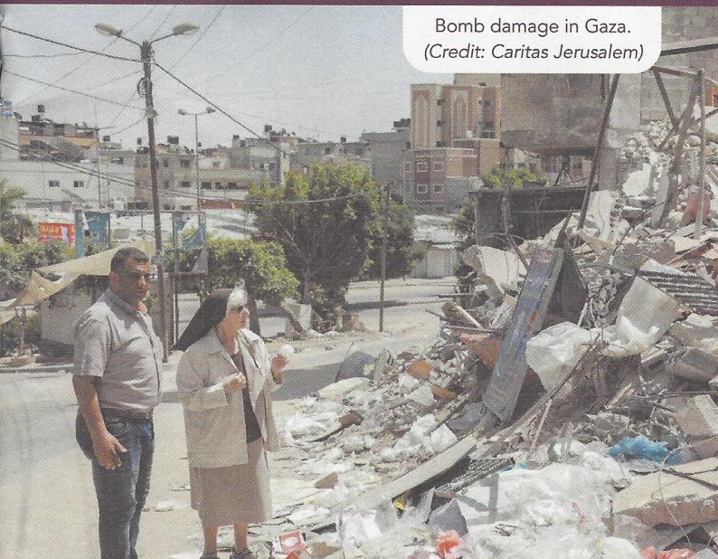
Bomb damage in Gaza.

“ The contribution of Embrace supported us in healing those who needed medicines, treatments and most importantly attention, love and care. Caritas Jerusalem ”