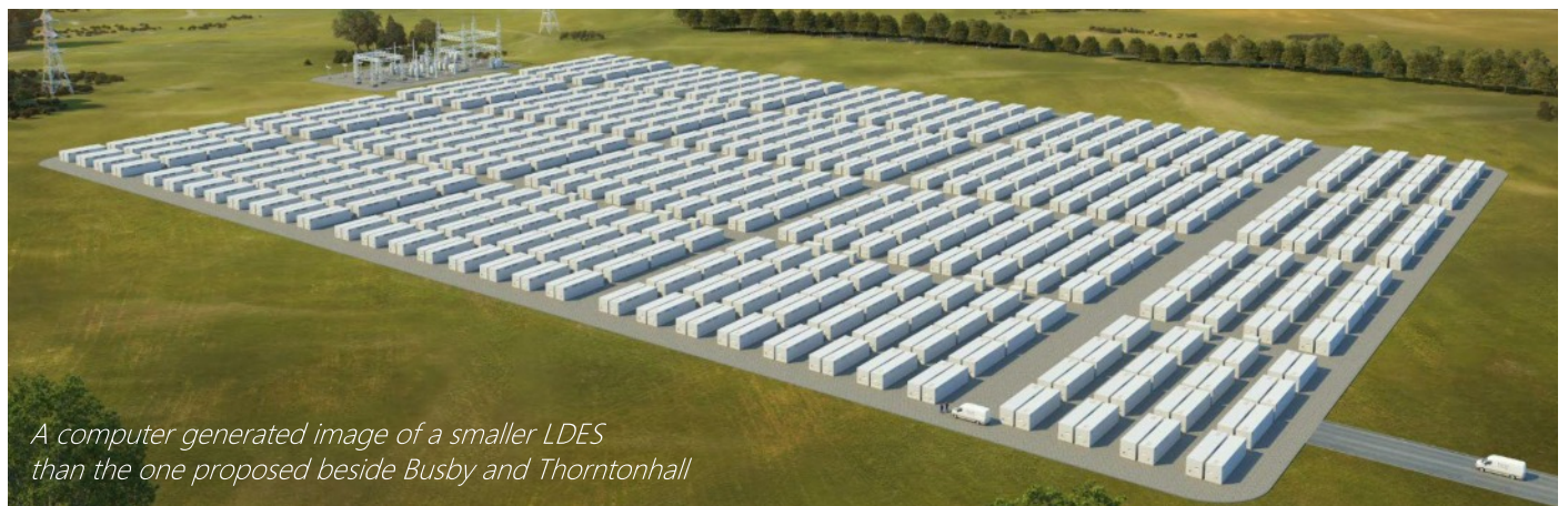
A computer generated image of a smaller LDES than the one proposed beside Busby and Thorntonhall

Jackton and Thorntonhall (requires membership approval): https://www.facebook.com/groups/413677208186476